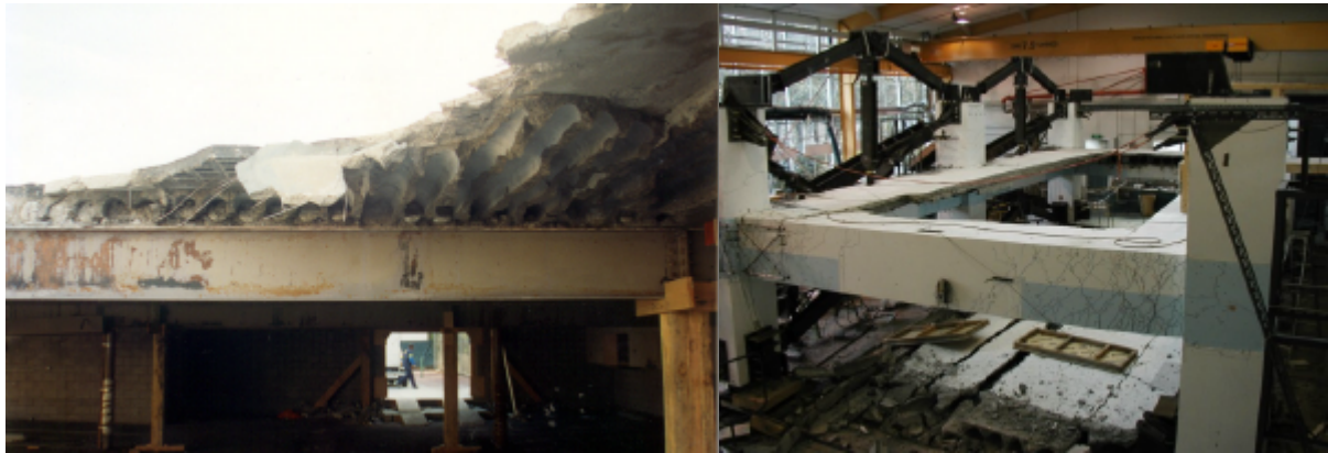
Figure 2: Photographs of damage to precast concrete floor systems. Left shows the Meadows Apartment Building, California, as a result of the 1994 Northridge earthquake. Right shows Matthews super-assemblage specimen at the completion of the Phase 1 testing. Note the specimen’s floor dropped out at a low seismic load with little damage to the surrounding frames.

A strong “parallel” system of research activities now exists as a means of accelerating the research uptake. The research is being undertaken in conjunction with a Technical Advisory Group (TAG) made up of stakeholders from the academic, design profession, and construction/manufacturing communities. Several members of the TAG are also on the code rewrite committee for NZS3101 (the NZ Concrete Standard)