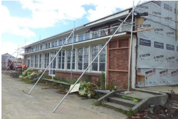
Figure 6. The Dominion block in early stages of the longitudinal test

A similar process was employed by BRANZ to test two classrooms of a Dominion block at Hammersley Park school in Christchurch in the longitudinal direction and a single classroom in the transverse direction in December 2013 (Figures 6 and 7). For these test buildings, the load was applied at the wall top plate level on both sides of the building because the roof was well braced in the ceiling plane and not expected to have any greater weaknesses than the side walls.