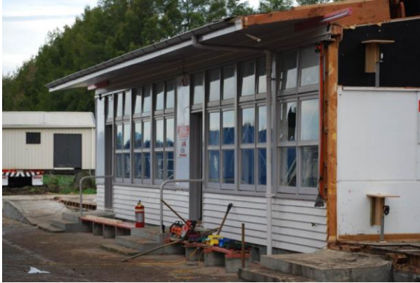
Figure 4. Building at end of longitudinal test