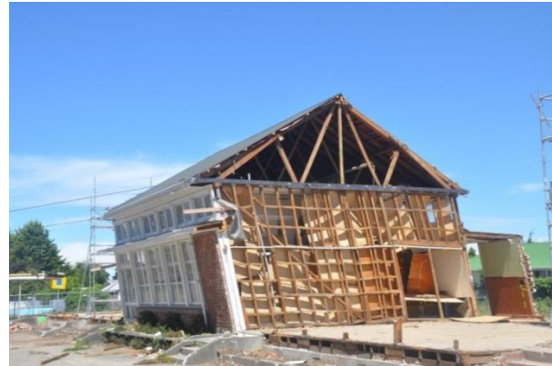
Figure 7. Building showing high levels of drift during the transverse test

The destructive tests confirmed the general engineering expectation that timber framed buildings with older glazed facades have strength and resilience significantly in excess of their calculated capacity. Test results for the Avalon block indicated that failure of the glazing in the longitudinal direction occurred at more than five times the nominal calculated probable capacity of the building. A margin of three to four times was achieved in the associated single direction test of a transverse wall. The Ministry's report on the test provides further information, with the BRANZ report providing full details of the test (BRANZ, 2013). For the longitudinal direction, the Dominion block tests indicated a margin of more than eight times the calculated probable capacity and in the transverse direction two to three times (BRANZ, 2014).