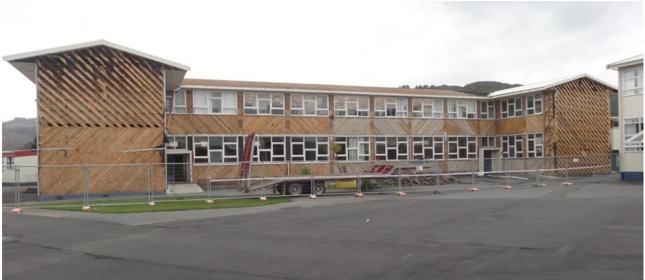
Figure 8. Nelson block structural framing

performance in the Canterbury earthquakes and knowledge gained from the other destructive tests outlined above, these structures are not at risk of collapse in strong ground shaking. Figure 8 shows the structural framing elements of the Upper Hutt College Nelson block following removal of the exterior cladding. This image also highlights the large footprint and hence low aspect ratio of these buildings.