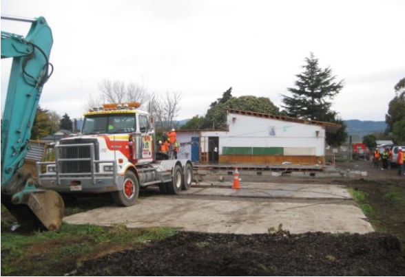
Figure 3. View of the Avalon block during testing

Two classrooms were tested from the block of four to ensure that the strength of the building could be reached with the available test equipment. Lateral loads were applied cyclically to both ends of the two classrooms at roof level (Figure 33) and also an isolated transverse wall using hydraulic actuators integral to house moving trucks connected to the 5 th wheel of each truck. The loads were distributed to three attachment points on each end of the building using steel pre-stressing tendons. The 5 th wheel attachments were connected directly to hydraulic actuators having 30 tonnes of pulling capacity and a stroke length of approximately 1.4 m. They could also be held at displacements corresponding to target load increments to allow for displacement recording using surveying station equipment.